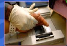
ROLLING THE WRITERS RIDGE PRINT

IN 1999 THE INTEGRATED AUTOMATED FINGERPRINT IDENTIFICATION SYSTEM (IAFIS) BECOMES OPERATIONAL PROVIDING THE FBI WITH AN ELECTRONIC ENVIRONMENT FOR FINGERPRINT PROCESSING.