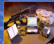
QCP IN THE FIELD