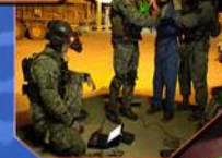
QCP IN THE FIELD